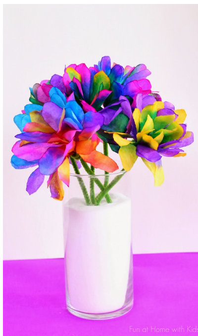
From Fun at Home with Kids

Using hot glue, I attached the base of each flower to a green pipecleaner and then placed them in a salt filled vase from the Dollar Tree. :) You can use marbles or whatever you would like as a vase filler - I just loved the contrast between the white salt and the colorful flowers.”